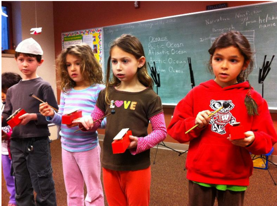
First and second graders play xylophone blocks in music class